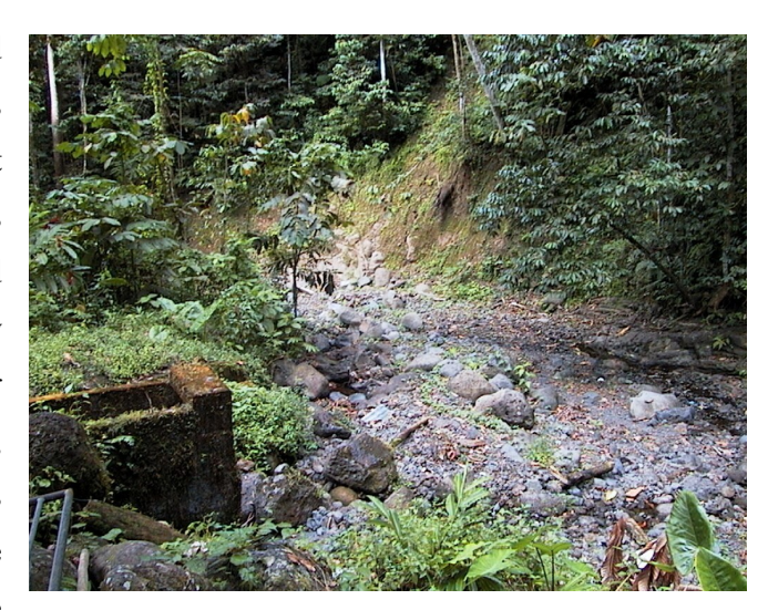
Figure 4: One of the main water supply sources dried up during dry season, Fuluasou river

The Apia Catchment area is considered an appropriate pilot project given its national/regional significance, relevant to its size. The issues present in this catchment impact on all inter-related sub-sectors of the water sector. They have implications for the urban water supply, public power supply, agricultural and recreational activities (eco-tourism), bio-diversity, land use planning as well as fisheries and marine eco-systems. The integrated approach in water resources management is