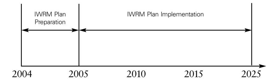
Figure 1. Milestones and timeframes for plan preparation and implementation

In preparing a transition strategy, it will be important to draw on lessons learned in the field of institutional change. Political processes, parliamentary approvals, national budgeting processes, institutional changes, and capacity building will be among the important aspects to be considered in a strategy for transition. Transitional arrangements are crucial to the success of the Plan, as are the roles and responsibilities of key actors.