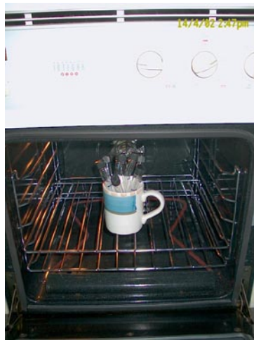
Sterilisation in a hot-air oven

Following any of the heat treatments, the tubes or bottles are then allowed to cool and the caps or lids tightly sealed. The tubes or bottles should be stored in a dark place until ready for use. Experience has shown they can be stored for at least 5 years in this manner.