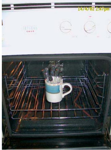
Sterilisation in a hot-air oven

Following any of the heat treatments, the tubes or bottles are then allowed to cool and the caps or lids tightly sealed. The tubes or bottles should be stored in a dark place until ready for use. Experience has shown they can be stored for at least 5 years in this manner.