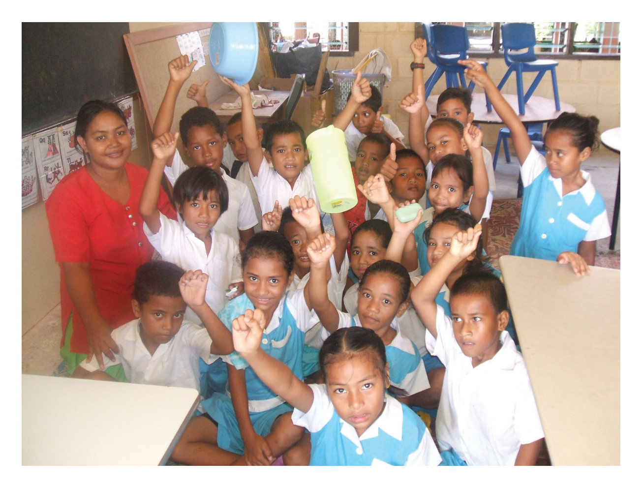
Figure 1: Students of Nauti Primary School in Tuvalu engaged in hand washing as part of their WASH campaign activities

In 2008, WASH campaigns got supported by WSSCC in Tonga and Tuvalu which concentrated in schools especially in the areas of water quality, rainwater harvesting and sanitation and hygiene promotion activities.