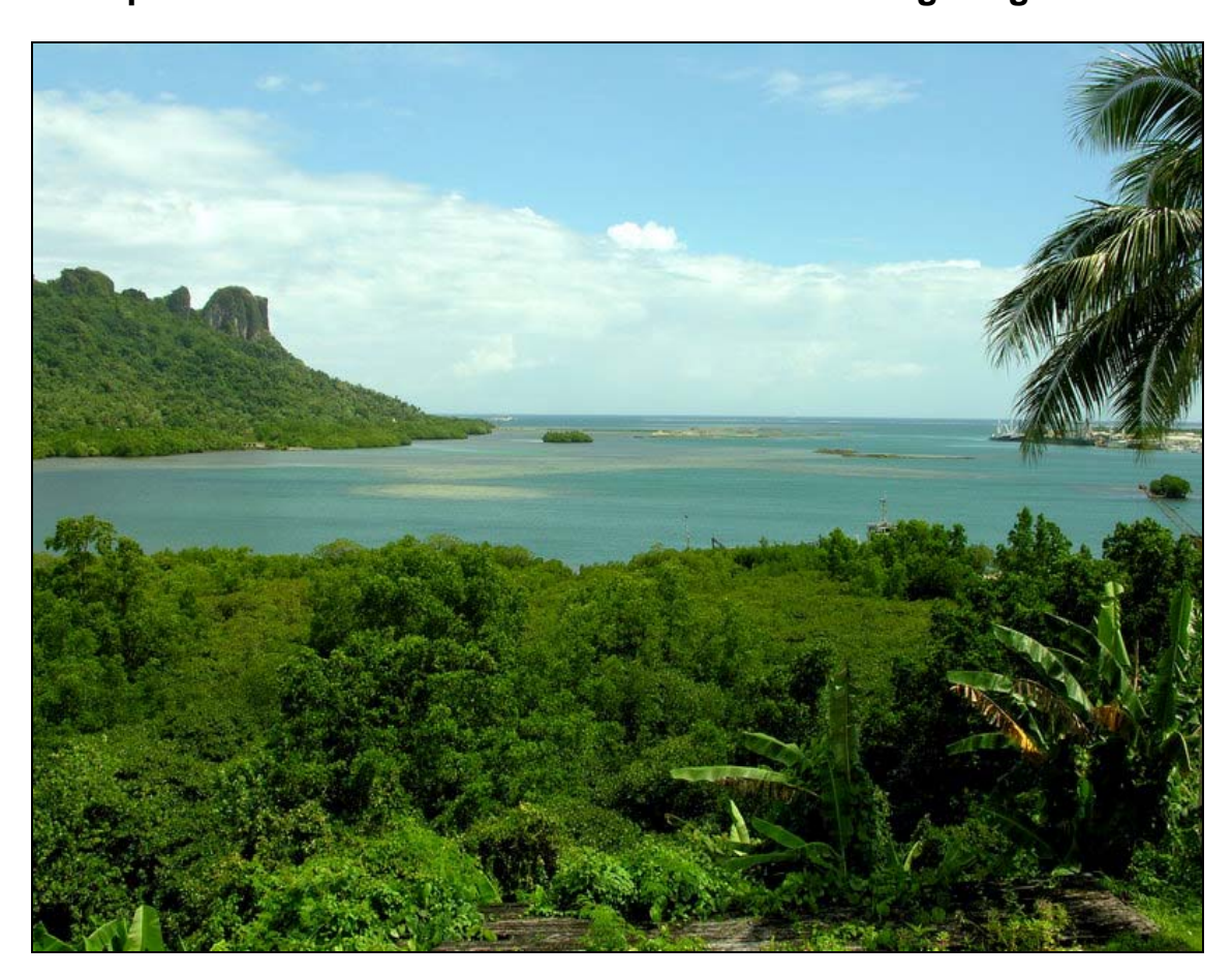
Pohnpei Island, Federated States of Micronesia 8<sup>th</sup> – 12<sup>th</sup> November 2010