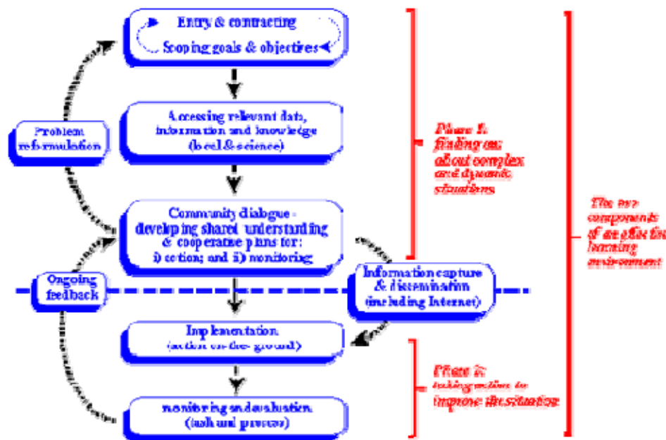
Figure 1 ISKM -- a participatory research framework to facilitate the identification and introduction of more sustainable resource management practices. The two phases interact to create an effective learning environment.

Over the past six years the activities outlined in the first four steps in the ISKM framework can be seen to have been undertaken in respect to the South Island tussock grasslands, albeit with funding obtained through a range of projects. The implementation of these activities have often been managed by different groups, and involved farmers, conservation managers, policy makers in local and national government, and researchers from a number of different institutions.