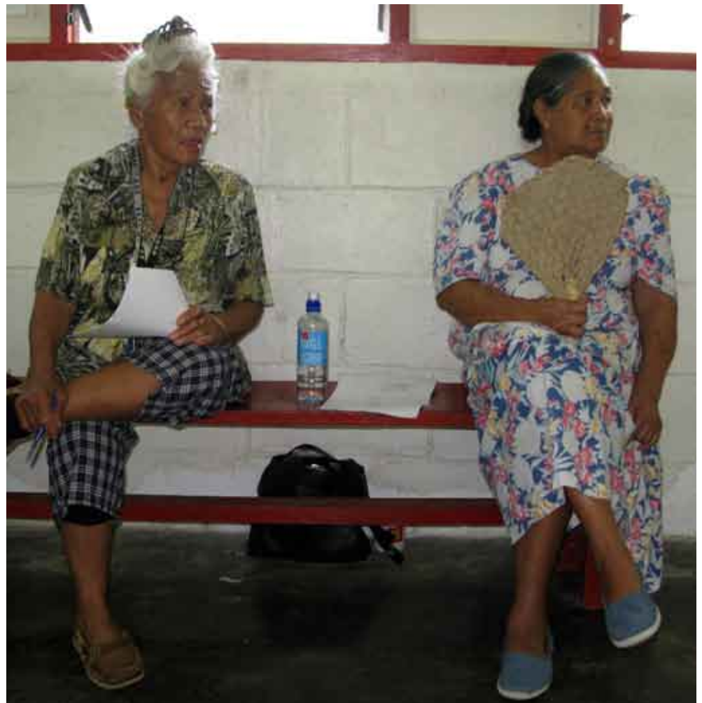
Women listen to presentations at Alofi North. All sectors of the community were well represented at the planning meetings.

The IWRM Project Management Unit (PMU) is committed to facilitating the process of getting NWSC approval for VWMPs and their submission to Cabinet for endorsement. The unit will also match VWMP priorities with national budget allocations and ensure that VWMPs are linked to the soon to be prepared National Water Plan. Finally, it will support villages prepare project proposals to access funds from other sources. Nominated PMU staff be liaisons for each community and attend Village Council meetings and water task force sessions. With these anchors in place, plan implementation is expected by mid-year; and results soon after!