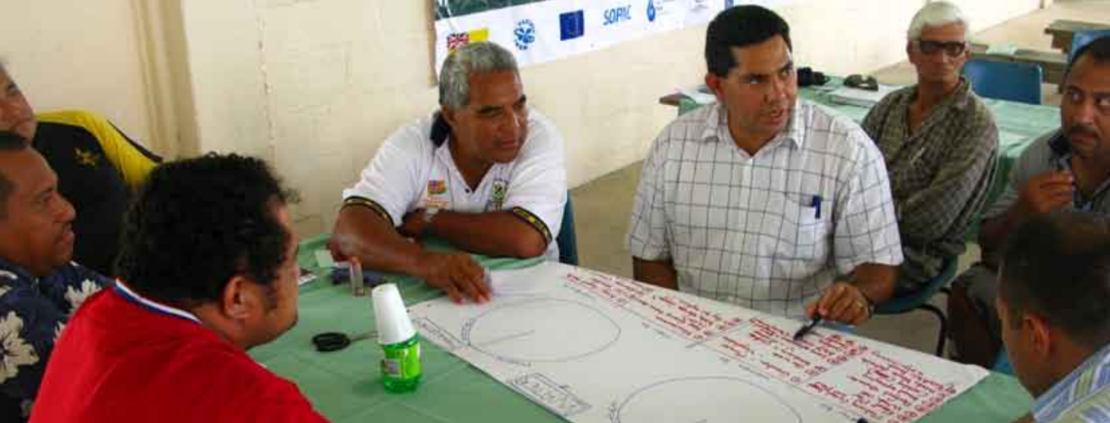
Men from Alofi South discuss gender roles and responsibilities for village water management.